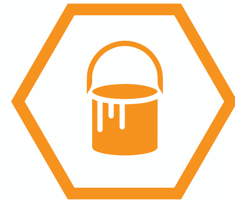
Paints & Specialty Coatings