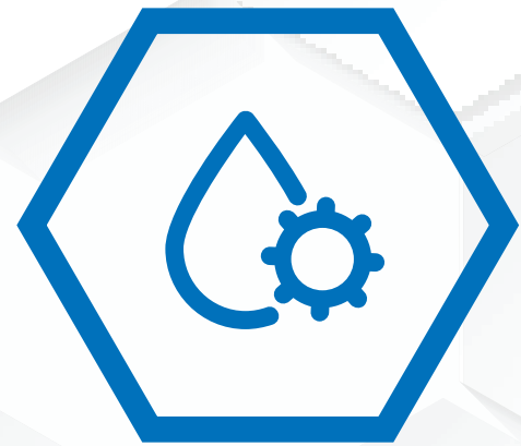
Oil and Gas

Aegex Technologies is proud to offer its 2nd Generation intrinsically safe tablet , the Aegex100M with faster wireless services, enhanced memory, and expanded storage. Operating in the most hazardous industries with explosive environments, Aegex solutions bring real-time connectivity to help organizations harness the power of data to optimize efficiency.