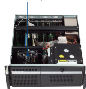
Easy-to-maintain system fan